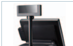
5. Customer display pole type VFD type (2 x 20) LCD type (graphic)