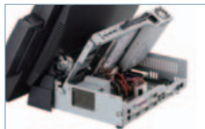
4. Easy to maintain and service Less than 4 screws to reach key components