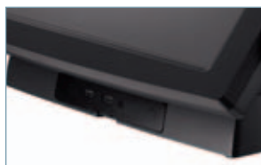
6. Front I / O cover