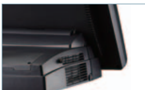
3. Thumb screw design easy to open rear cover