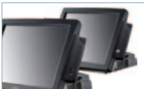
2. MSR / Finger print MSR / I-Button